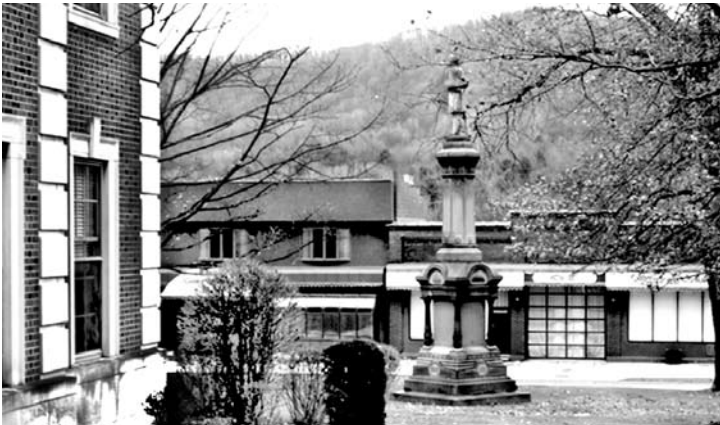
Today’s Courtyard Restaurant, 505 W. Main rests on the location of the Benett House. Hotel.