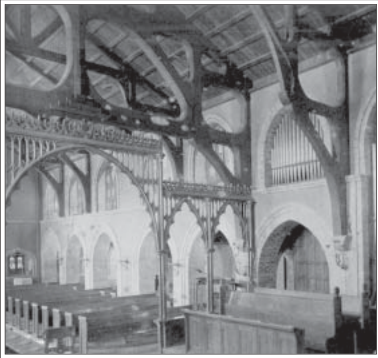
Saint Luke's Archive Collection

The flooring under the seats is of oak. The central passage way, the aisles, the choir and sanctuary are tiled. The aisles are filled with cream colored tile with a border of