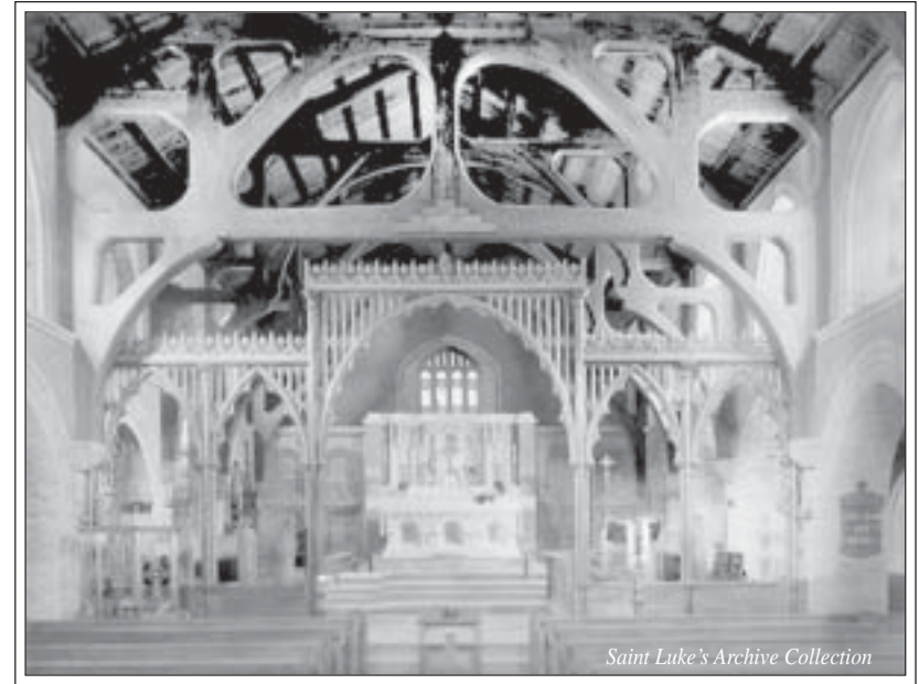
Saint Luke's Archive Collection

One of few remaining Pristine Examples of the Architect's Genius